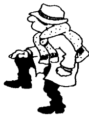
Leg-bye Signalled when the ball is dead.