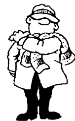
5 Penalty runs to the fielding side. Signalled when the ball is dead.

Umpires must signal events in the order they occurred – Penalty run signal precede all others.