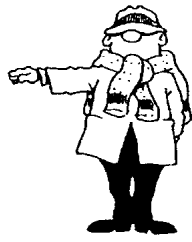
NO-BALL Signalled when the ball is in play.