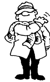
5 Penalty runs to the batting side. Signalled when the ball is dead.