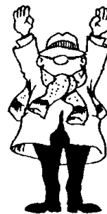
Boundary 6 Signalled when the ball is dead.