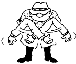
DEAD-BALL Signalled when the ball is in play or dead.