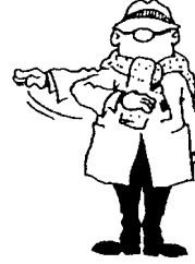
Boundary 4 Signalled when the ball is dead.