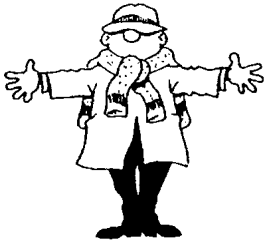
WIDE Signalled when the ball is in play or dead.