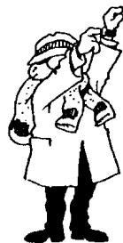
LAST-HOUR Signalled when the ball is dead.