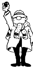
New ball Signalled when the ball is dead.