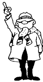
* Out * Signalled when the ball is in play or dead.