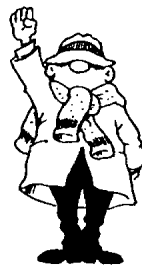
Bye & PLAY Signalled when the ball is dead.