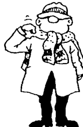
SHORT-RUN/s Signalled when the ball is dead.