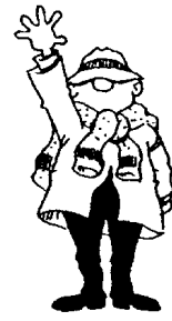
5 runs Signalled when the ball is dead. Not penalties.